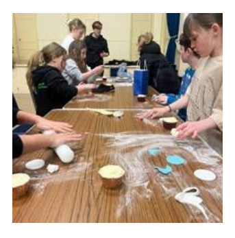
Youth Club – Thursday evening at St Drostan's as an intergenerational social time embedding Christian values through activities, games, arts and craft and music.