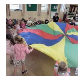
Some of our other activities;